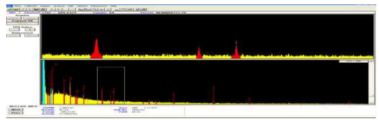
Fig.3: A spectrum of activity of radionuclides in the venom of snakes, caught in territory of Sabirabad and Kurdamir

Research on the influence of EMR on lifespan of envenomed mice were carried out in experiment on threemonthly not purebred white mice with weight of a body 22-25 g. Snake venom was injected into the mice intraperitoneally in a dose of weight of a body of 0.2 mg/g. We had used 70 mice in experiments. Mice were divided into two groups: control and experimental. Standard venom was injected i/p into control group of mice and the venom allocated from snakes, subjected to an irradiation at various modes was entered into experimental groups of mice. After envenoming of mice with vipera venom, oppression of condition was observed